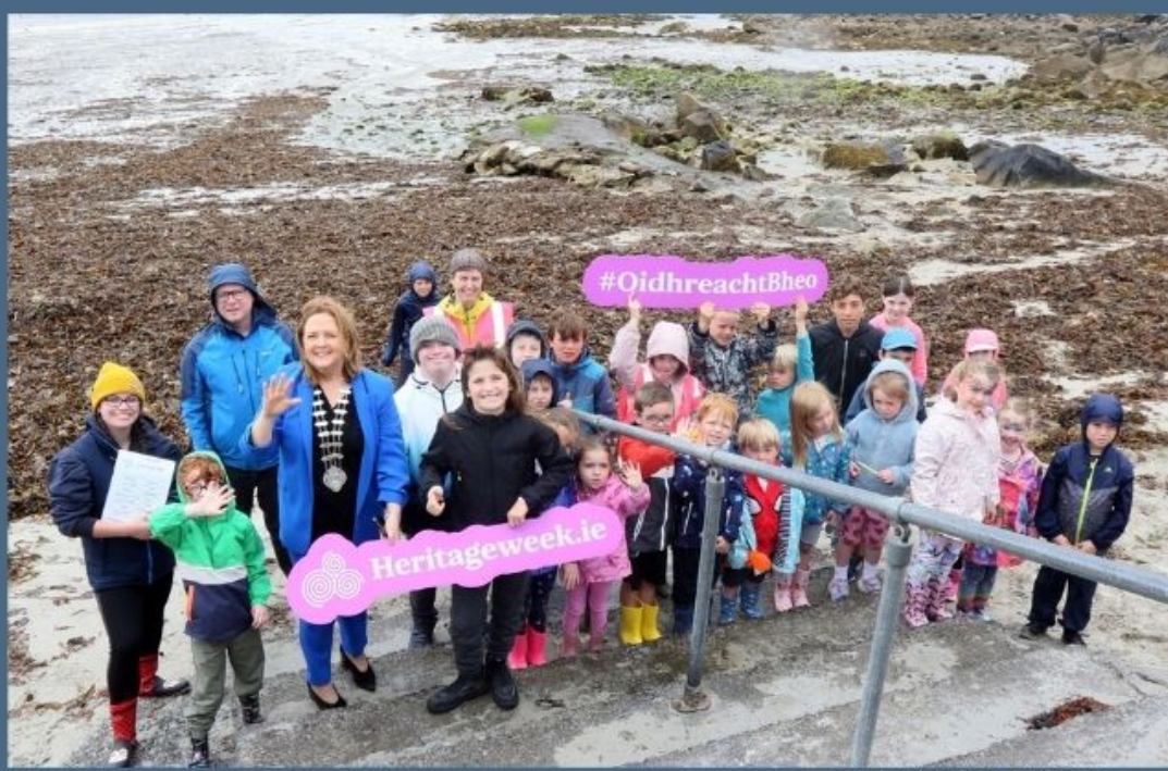
National Heritage Week 2023

Free Event - Booking Essential https://tinyurl.com/mryf7f4j